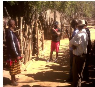
Mantenga Cultural Village