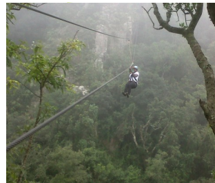
Malolotja Canopy Tour